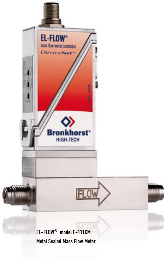
EL-FLOW® model F-111CM Metal Sealed Mass Flow Meter