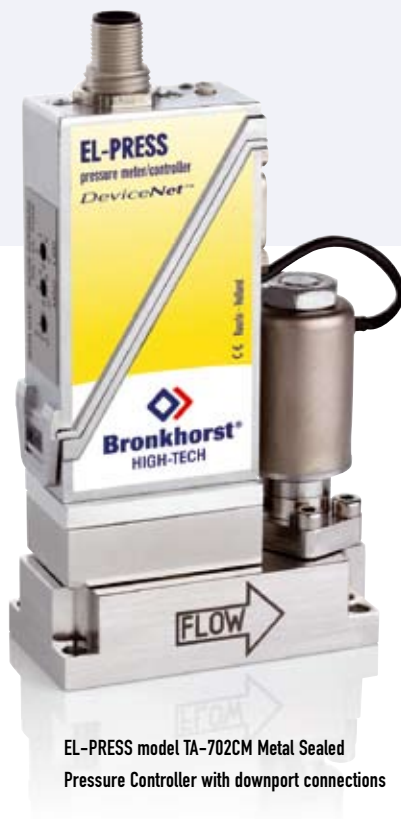
EL-PRESS model TA-702CM Metal Sealed Pressure Controller with downport connections